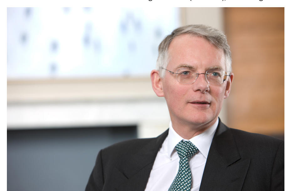
Piers Gardner Chair of the CCBE Permanent Delegation to the European Court of Human Rights

This is the first time that the CCBE, as a forceful voice of lawyers' experience, has joined the reform debate. It is not before time. As representatives of victims of human rights violations, lawyers before the Court are uniquely placed to understand the true cost of the current delays. They are also familiar with the procedure and can therefore propose practical solutions.